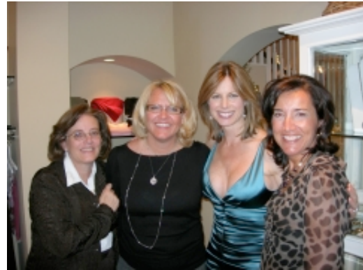
Pictured at the Ella Bleu Fundraiser: