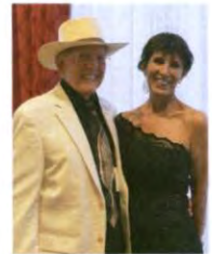
Tony and Yolanda Rainold Friend of the Children Award