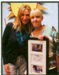
Volunteer of the Year Award